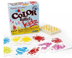
COLOR ADDICT KIDZ